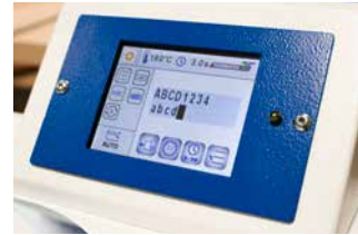
NEW: color touch display

Stand-alone operation: or connection to a PC system via serial interfaces and Ethernet